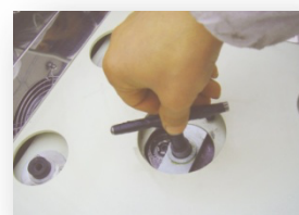
1-50mm Shaking Diameter Adjustment