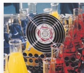
Forced Air Convection